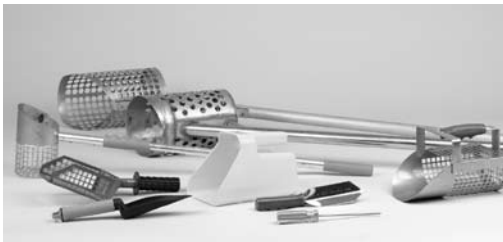
Figure 10, Various commercially available recovery tools

A trowel is best for recovering items in clay or gravel areas.